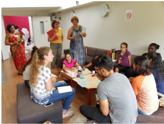
GROUP DISCUSSION WITH THE FACULTIES