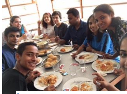
2.At Picnic Spot 4.Lunching Together