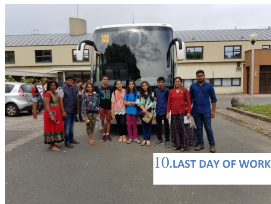
10.LAST DAY OF WORKSHOP