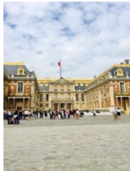
12. VERSAILLES PALACE