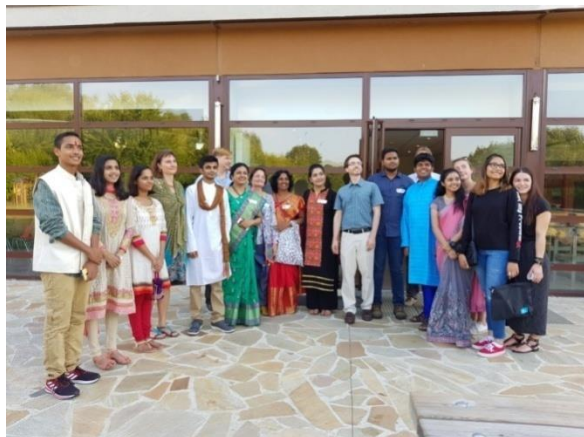
5.WITH THE SPONSERS