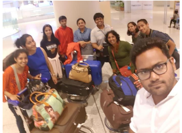
14.END OF TRIP: AT THE MUMBAI AIRPORT