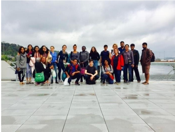
11. AT THE LA SEINE MUSICALE