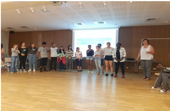
1. INTRODUCTORY SESSION AT VICTOR HUGO COLLEGE